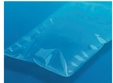
High temperature resistance and non-wetting surface for bagging film